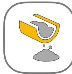
Concrete & Mortar Additives